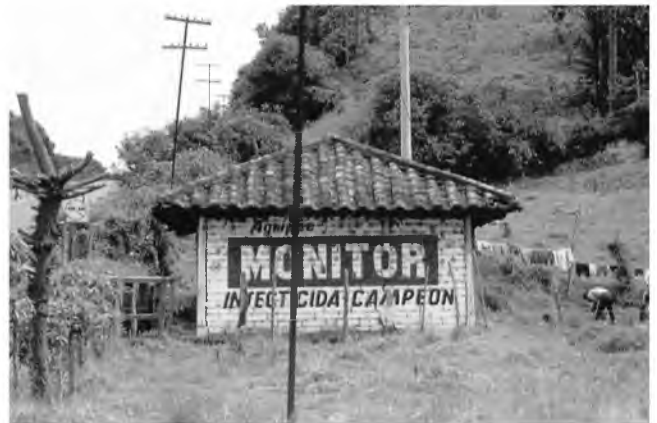
A roadside advertisement for methamidophos on the side of a house

Yet we have encountered limitations to the FFS approach that argues for diverse strategies. Farmers differ in their levels of resources, their willingness to take risks, and their incentives to change production methods. 23 Paredes classified farmers by their approaches to farming and found FFSs were more attractive to certain social groupings than to others. In particular, the most enthusiastic participants were "landless laborers" whose participation was most motivated by the opportunity to co-invest in production and by the platform for horizontal social relationships, and "highly pragmatic" and "inquisitive" farmers who had a natural interest in the discovery learning. Meanwhile, field schools appeared to be of less interest to "high-risk takers," those individuals who regularly overextended their resources in agriculture and were readily open to adopt (and disadopt) technologies, as well as "intermediate farmers," who tended to co-invest in land, rather