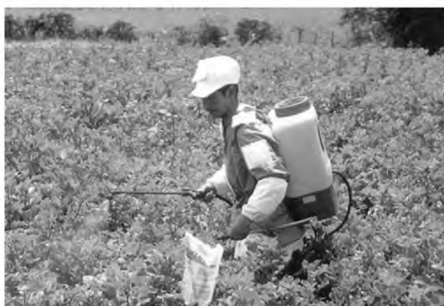
Pesticide application in a potato field; the white patches on the worker's clothing are for exposure monitoring

Administrative controls are not readily applicable among smallholder farmers, leaving SUP to focus on elements 3 to 6. Unfortunately, one recent seven-year study by Novartis, now Sygenta and formerly Ceiby-Geigy and one of the largest pesticide producers in the world, found that SUP interventions in Latin America,