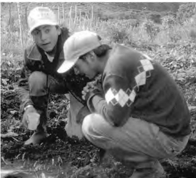
Teaching pest identification in a farmer field school

towards the reduction of pesticide use and safe use of pesticides.