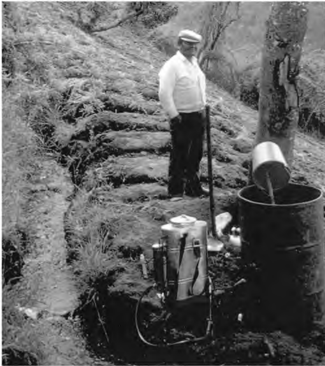
Pesticide mixing and pouring into backpack sprayer beside a stream

nity. During presentations in community meetings, the discovery of tracer on applicators' hands and faces, children's faces, and household objects such as the kitchen table generally stunned people. 15 Footage of the tracer studies has appeared on national television, and a media specialist is producing a training video that will include participant comments and recommendations for reducing exposure.