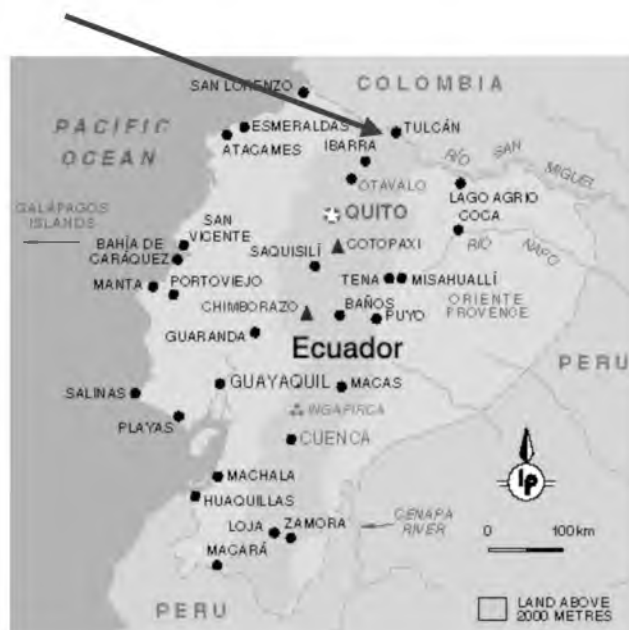
Figure 1—Potato-producing province of Carchi, Ecuador (location of Carchi indicated by arrow).

Family members are thus exposed to pesticides in their households and in their work via a multitude of contamination pathways. Such contamination results in