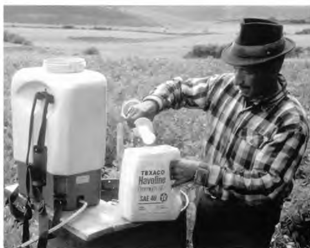
Pesticide mixing and pouring without gloves and respiratory protection

Africa, and Asia were expensive and largely ineffective, particularly among smallholders. 18 The authors argue that: "The economics of using pesticides appeared to be more important [to small farmers] than the possible health risks" (p. 121). The most toxic compounds remain among the cheapest on the market in Carchi, partly due to restricted markets in most industrial countries. The need to devise economically viable alternative production methods to forward implementation of elements 1 and 2 led us to activities to decrease pesticide use in potato production.