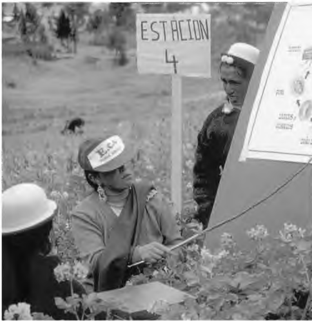
Class on pest life cycle