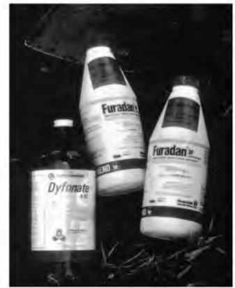
Common liquid carbofuran (90%) formulations imported from Colombia

Such initial work led to a province-wide stakeholders’ meeting entitled “The Impacts of Pesticides on Health, Production, and the Environment” in October 1999. One hundred and five representatives from government, industry, development organizations, communities, and the media participated. Presidents from the provincial boards of agriculture and health chaired sessions. Ministerial representatives from agriculture, health, and education participated, as well as the governor and mayors or representatives from all of the provincial municipalities. After a morning of sharing research results, participants broke into four discussion groups in order to assess opinions on the situation, to determine suggestions for particular stakeholders (farmers, government, industry, and consumers), and to make recommendations for future action. As one consequence of the meeting, the group formed a small committee composed of the directors from INIAP, the Ministry of Education, and the Ministry of Health, who drafted a “Declaration for Life, Environment and Production in Carchi.” The Declaration included the following demands: