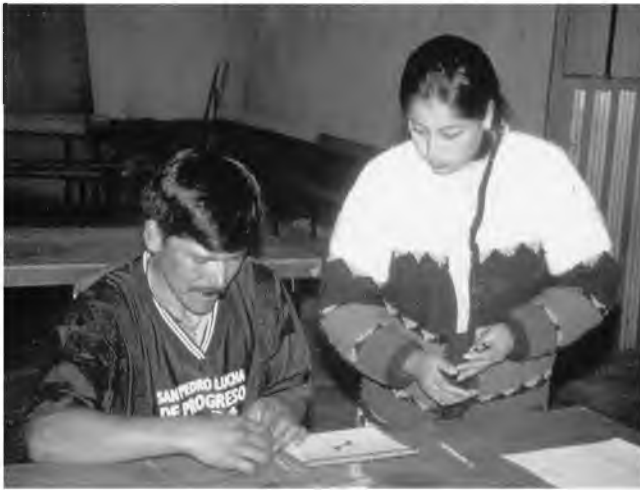
Neurobehavioral testing of a pesticide-exposed worker

make a joke about inviting all the good insects to come out of the field before we apply pesticides. Of course, it is a poison, and we kill everything. We destroy nature when we do not have another option for producing potato.