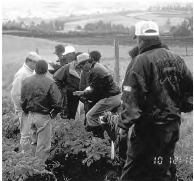
Farmer field school workers identifying pests

Such initial work led to a province-wide stakeholders’ meeting entitled “The Impacts of Pesticides on Health, Production, and the Environment” in October 1999. One hundred and five representatives from government, industry, development organizations, communities, and the media participated. Presidents from the provincial boards of agriculture and health chaired sessions. Ministerial representatives from agriculture, health, and education participated, as well as the governor and mayors or representatives from all of the provincial municipalities. After a morning of sharing research results, participants broke into four discussion groups in order to assess opinions on the situation, to determine suggestions for particular stakeholders (farmers, government, industry, and consumers), and to make recommendations for future action. As one consequence of the meeting, the group formed a small committee composed of the directors from INIAP, the Ministry of Education, and the Ministry of Health, who drafted a “Declaration for Life, Environment and Production in Carchi.” The Declaration included the following demands: